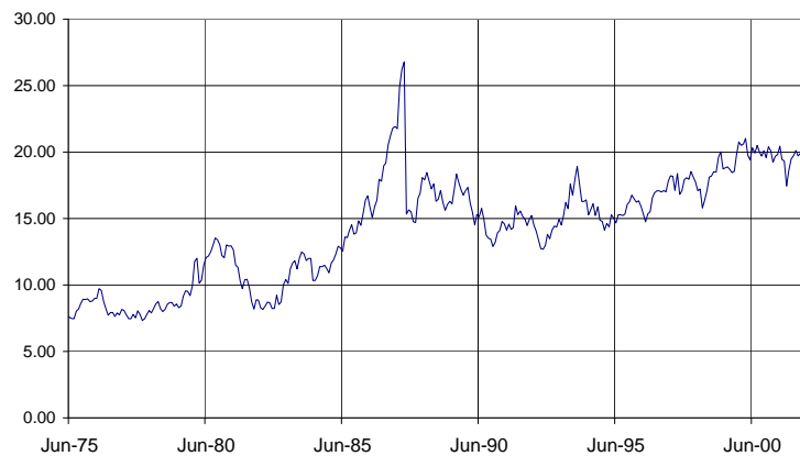
Figure 2.1 Australian All Ordinaries Price/Adjusted Average Earnings

2.13 A number of features of this figure are worthy of note: -