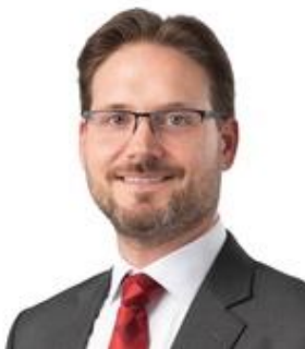
Prof. Benjamin Avanzi

For ALL enrollment related inquiries, please contact Stop 1 . For general information, please see http://ask.unimelb.edu.au/