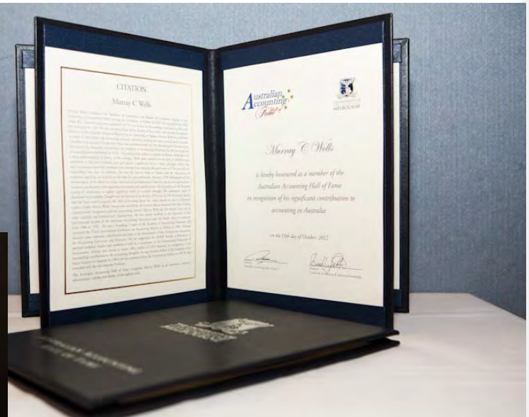
Murray Wells: citation folder