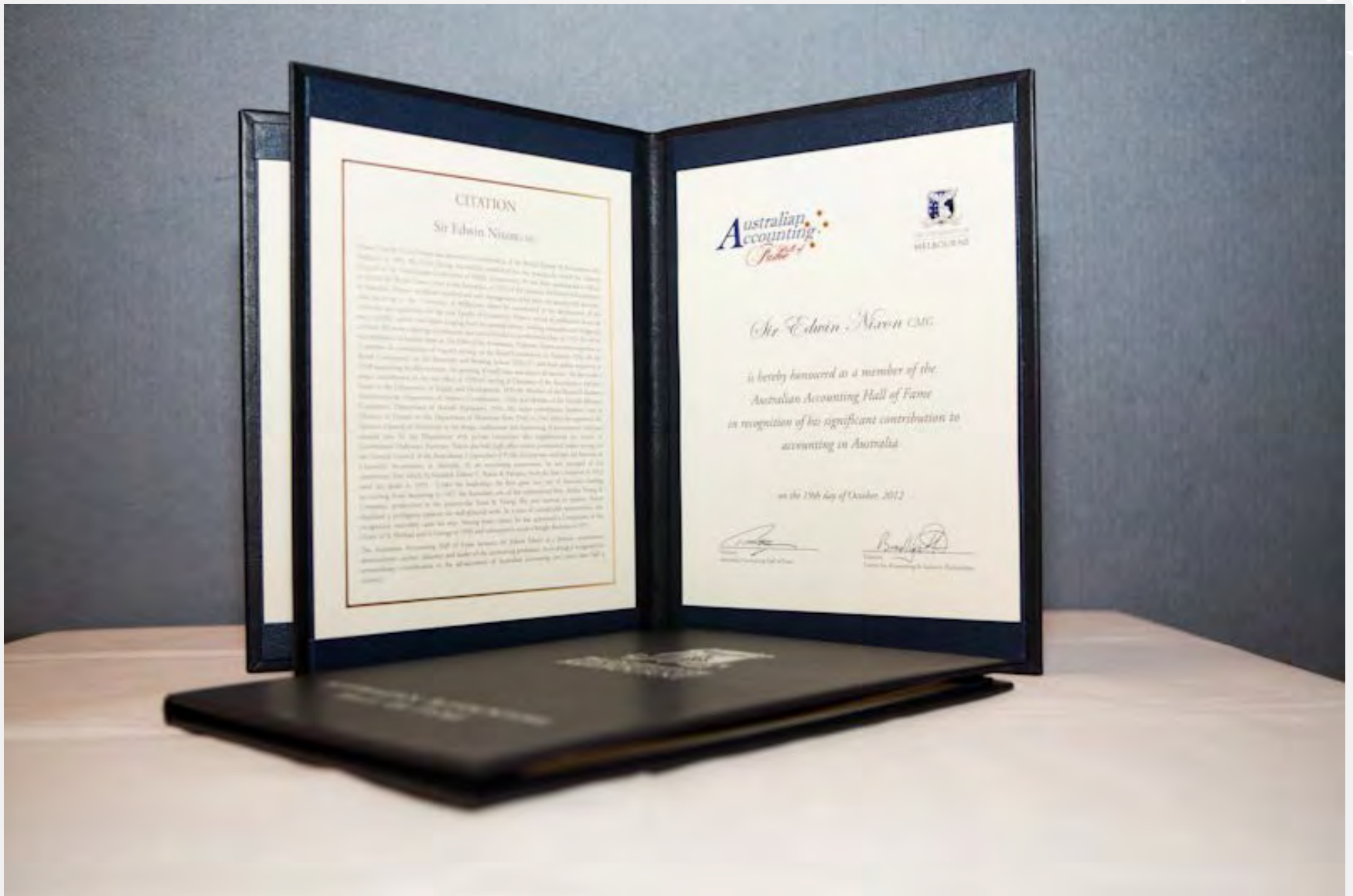
Sir Edwin Nixon: citation